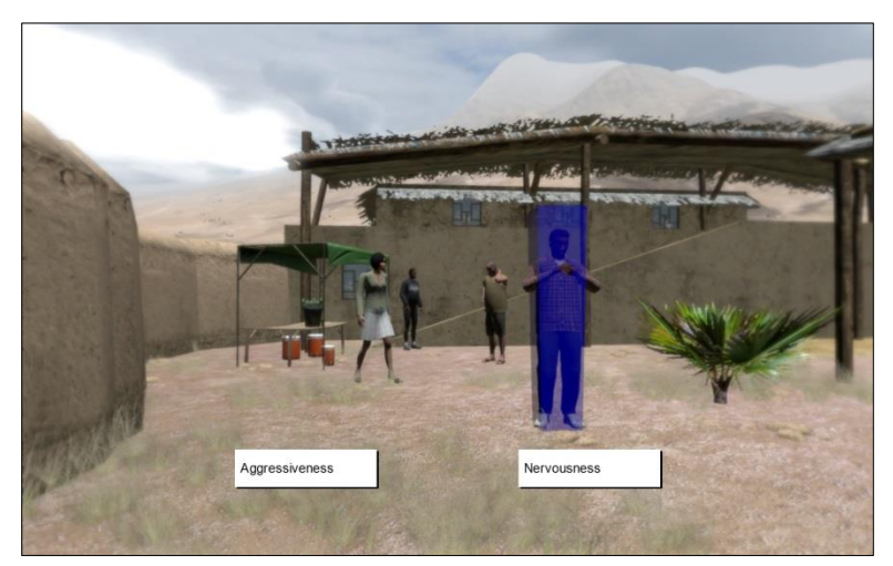
Figure 1: Example of the translucent blue box in the Highlighting condition.

The Highlighting condition included an additional element intended to orient participants' attention to the presence of targets. Targets were highlighted by a translucent blue box (Figure 1). Layering a non-content related feature, such as a circle, arrow, or spotlight, into a SBT environment has shown to improve search and scan skills (Chapman, Underwood, & Roberts, 2002; de Koning, Tabbers, Rikers, & Paas, 2007; de Koning, Tabbers, Rikers, & Paas, 2010; Underwood, 2007).