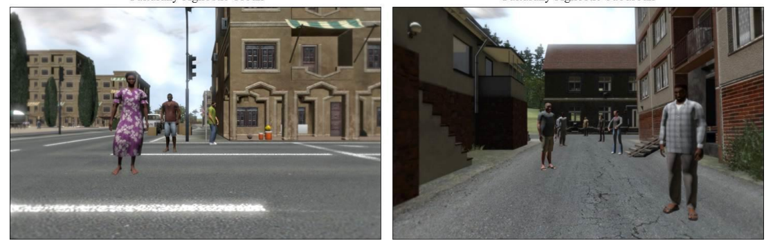
Figure 3: Training scenario terrain settings.