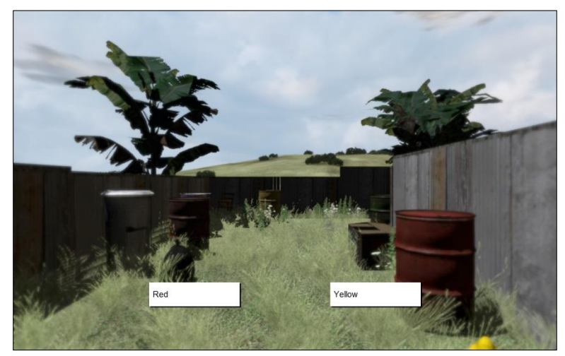
Figure 4: Barrels in the task familiarization scenario.

Participants viewed an instructional slideshow to familiarize them with the experimental task procedure. Following the slideshow, participants completed a familiarization scenario which provided the opportunity to practice the detection and classification procedure. The familiarization scenario required participants to detect red and yellow barrels and classify each by color (Figure 4). Non-human targets were used in order to avoid priming participants for the experimental stimuli.